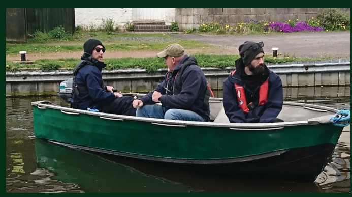
Aluminium heavy-duty work boat 4 metres USC