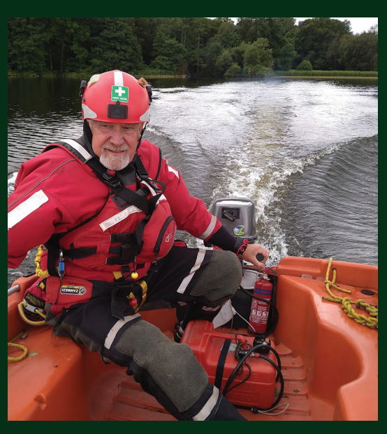
Jeanneau 360 Newmatic Rigiflex - 3.6 metres USC / SSC