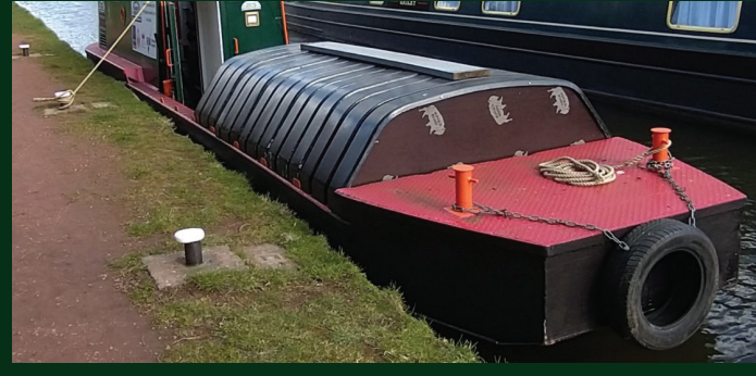
Heavy displacement workboat - 12 metres USC