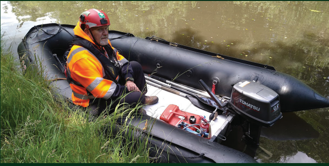
Bombard C3 Commando Inflatable - 3.8 metres USC/SSC/RBR