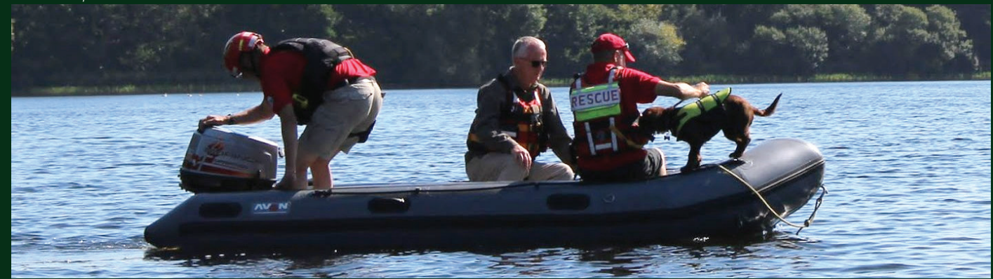
x2 Avon W400 ERB Emergency Rescue Boat - 3.8 metres USC/SSC/RBR